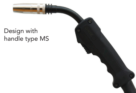
Design with handle type MS