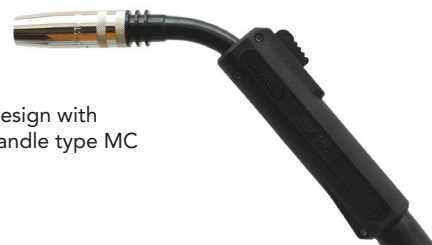
Design with handle type MC