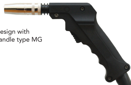
Design with handle type MG