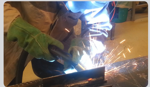
DIX MRZ 304 / with fume extraction