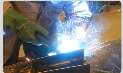
DIX MRZ 304 / without fume extraction

DINSE provides the right equipment for every application. The new flue gas extracting welding torches are available in gas- and water-cooled versions.